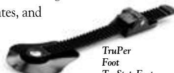
TruPer Foot TruStep Foot Summit Lock